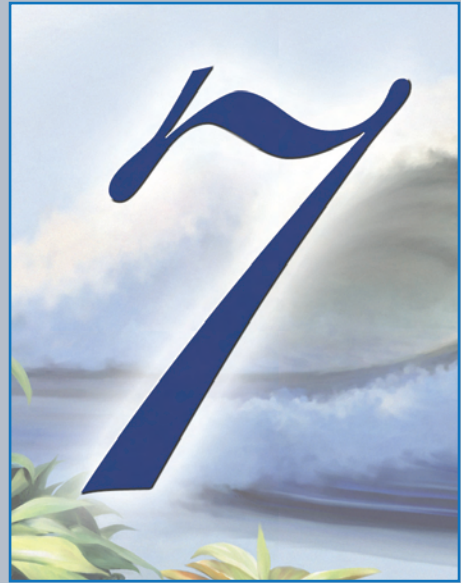
God's symbol of creation is indestructible.

God made the Seventh-day special. It was the indestructible symbol of the fact He created the world. You can no more stop the coming of the seventh day than you can stop the sun from rising in the morning sky. When we work six days and rest on the seventh, we are honoring the God of creation.